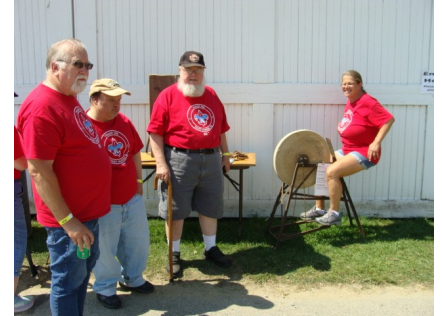
Special needs Scout troop on their annual visit to Fall harvest Days