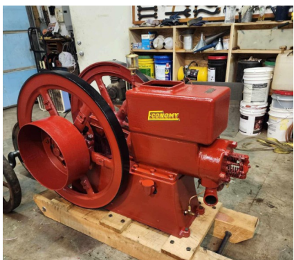
The recently restored Economy engine, one of several being restored