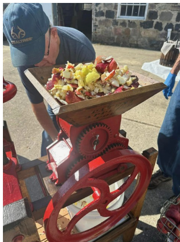
Restored apple cider press