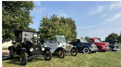
Antique car show at FHD