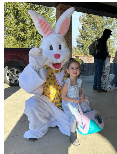
That pesky bunny sure is photogenic