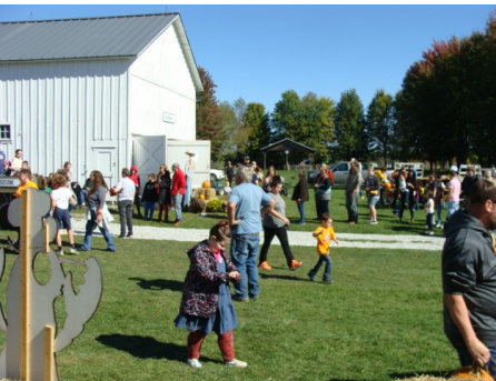
Crowds on a nice October day