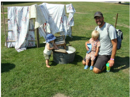
Even the youngest can learn chores