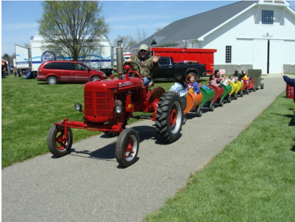
Kids enjoy the barrel train ride at Earth Fair