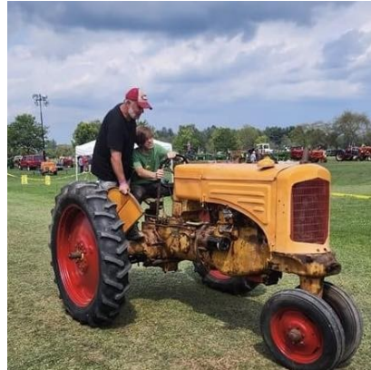
Maiden voyage of Tommy's Minneapolis Moline Tractor