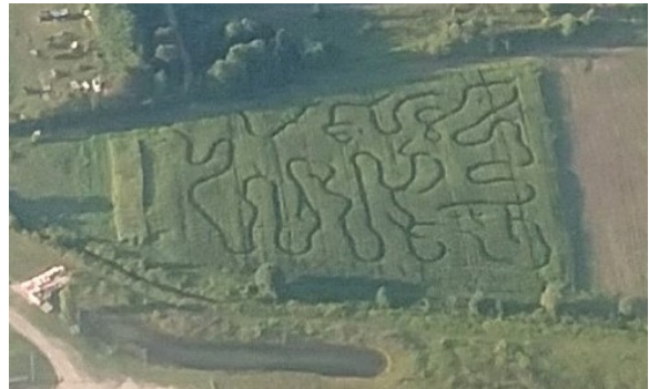
2024 Corn Maze from 2500 feet

Sweet corn grown at Goodells County Park this year was in ample supply providing plenty for our Fall Harvest Days event. 100 dozen ears were sold and approximately 500 dozen donated to homeless shelters, Churches and soup kitchens.