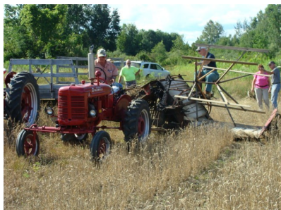
Harvesting wheat with the 1930's International binder

Although not a heavily attended visitor event, the harvesting of wheat which is used for threshing at the Fall Harvest Days brings out a good crew of volunteers both young and old.