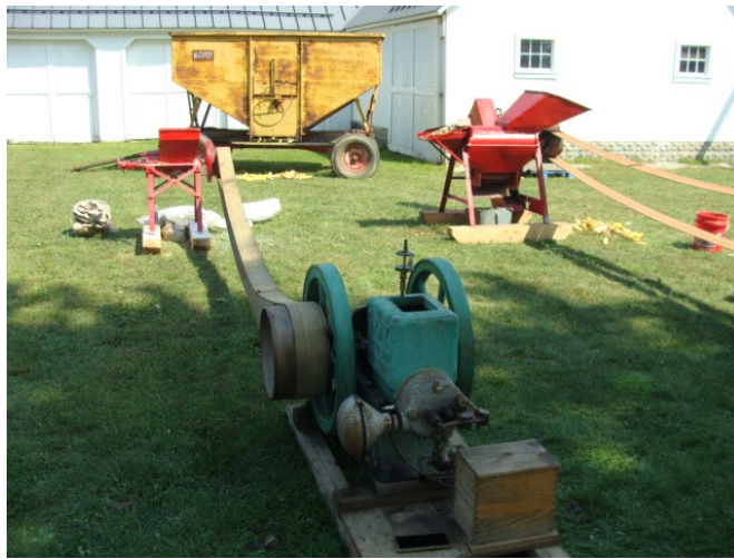
The back portion of the T Barn will soon house the Museums collection of hit & miss engines and be opened for public access.