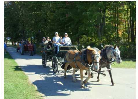
Rides to the pumpkin patch