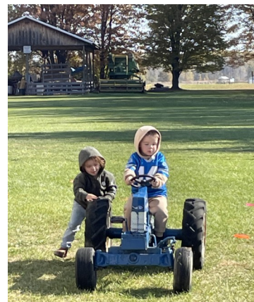
(right) The Museum acquired a collection of petal tractors with the intent of hosting a kids tractor pull at various events