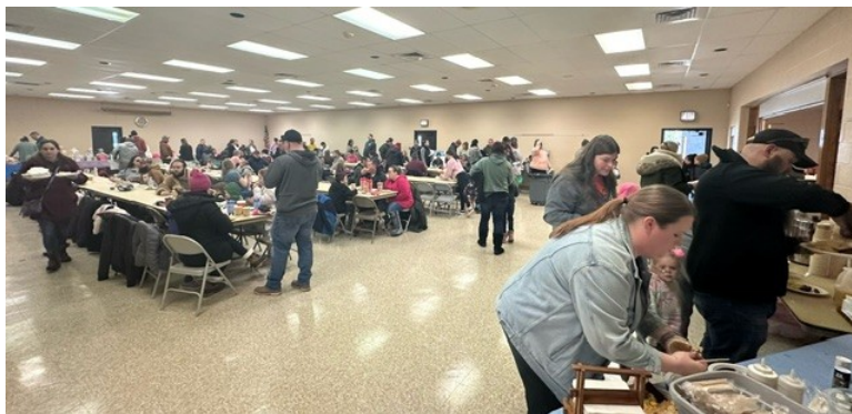
Visitors enjoying a good breakfast