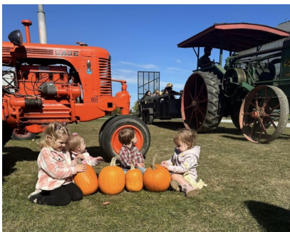
Showing off the harvest