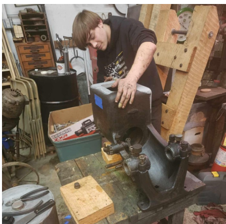
(left) Young members learning restoration skills by rebuilding a hit & miss engine