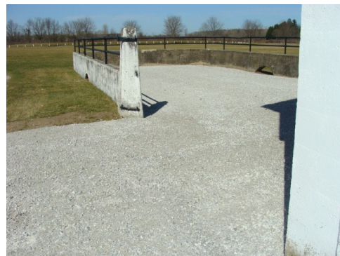
The Farm Museum in cooperation with parks maintenance excavated and filled the Bull Pen area to create a display area for some of the Museum collections