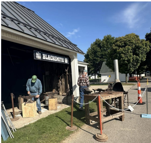
The blacksmith shop in the T Barn had its debut at Fall Harvest Days. This area is continuing to evolve and grow to be a premier area of the Museum

Each year volunteer members tackle items on the long list of projects at the Museum in an attempt to expand and maintain the collection. Shown below is a sampling of the projects that were worked on or completed this past year.