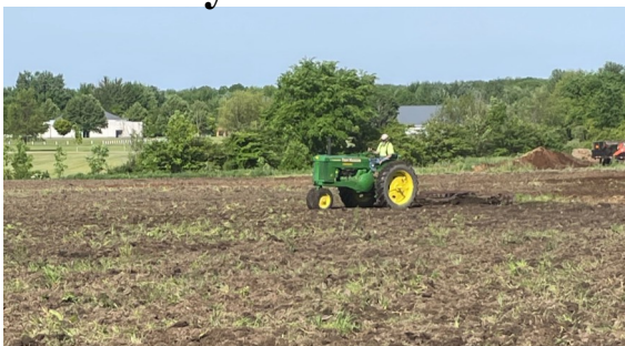
Plow day not only helps the Museum prepare the fields for planting but offers the opportunity to have visitors experience the preparation of the planting season.