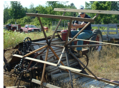
Glen Schade operates the binder

Although not a heavily attended visitor event, the harvesting of wheat which is used for threshing at the Fall Harvest Days brings out a good crew of volunteers both young and old.