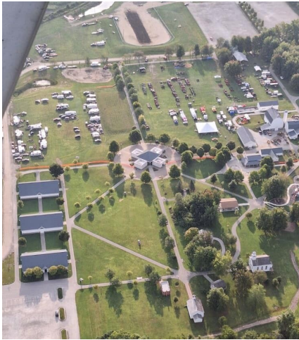
Aerial view of Fall Harvest Days