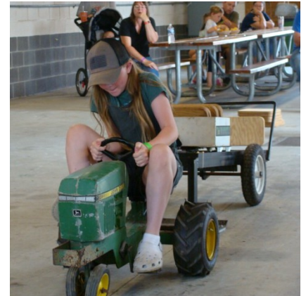
Youth pedal pull participant