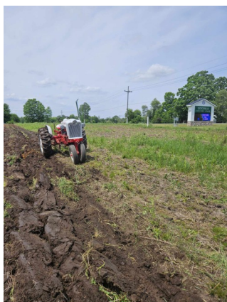
Wet conditions for plow day

We are ready for spring field work, the drainage ditches are dug, and the rocks are lying on top just waiting for warm dry days.