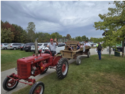
A ride around Goodells County Park on the people mover