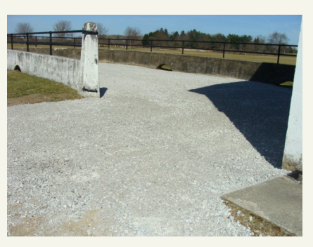
Bull Pen Resurfacing

Thank you to the County Park and it's employees for excavating the "bull pen" attached to the bull barn. Top soil was removed and cement millings placed to make this a "show area" for some of the Museum's equipment.