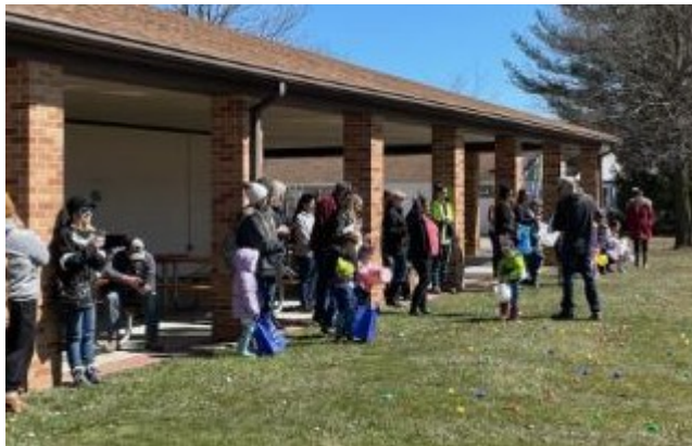
Waiting for the Easter Egg Hunt