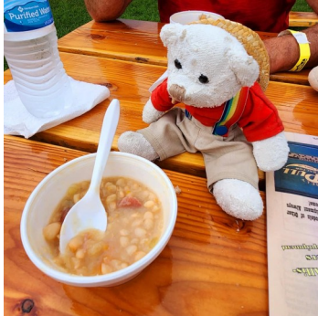
Enjoying a cup of bean soup