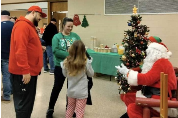
A little chat with Santa