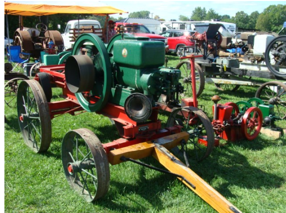
Equipment on display