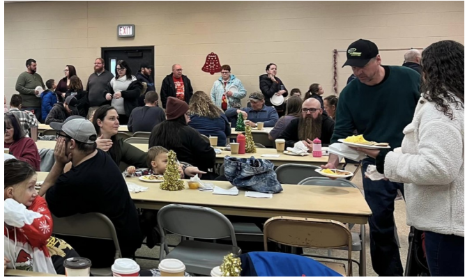
Enjoying a meal