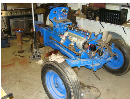
Ford 2N before (left) and after (right)