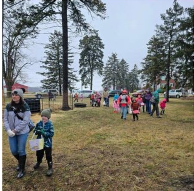
Day on the farm benefiting the Pantry Project with Sawmill Creek and the Rustic Ramblers 4-H Club