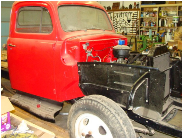
Ford F5 Medical Center farm truck. Front clip is sent out for a rebuild, wiring and exhaust completed. Next the truck is to be sent out for a paint job and the wood bed constructed.