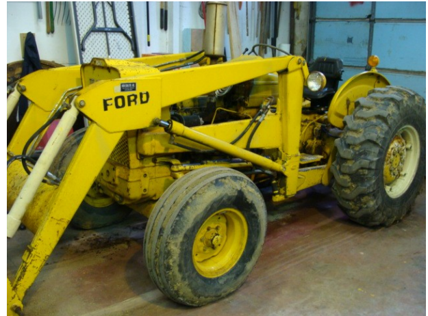
Ford loader tractor repairs continue by replacing parts damaged by accidental fire