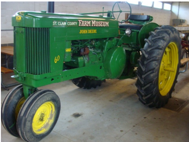
John Deere 60 restoration completed