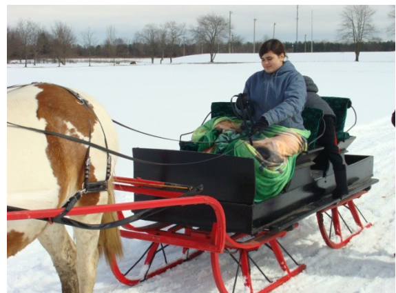
Waiting for riders