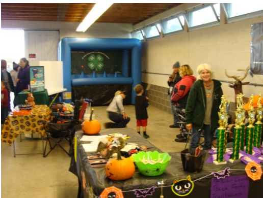
Partnering with 4-H at Pumpkin Fest