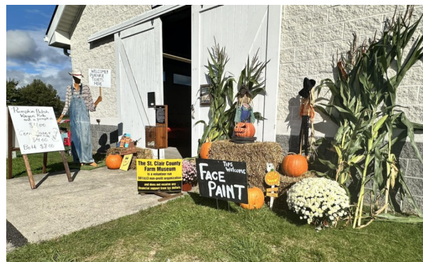
Enter for fun!