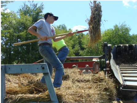
Youngsters helping with threshing