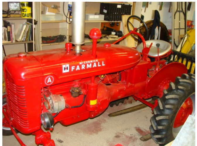
Farmall A restoration completed