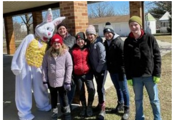
A quick pose with the star of the day