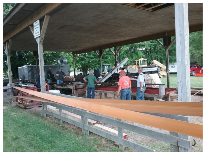
Museum members demonstrating the Port Huron Engine and sawmill along with static displays of equipment