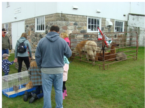
Youngsters and parents check out the various displays provided by 4-H clubs