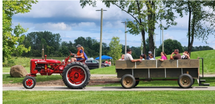
Taking a ride on the people mover