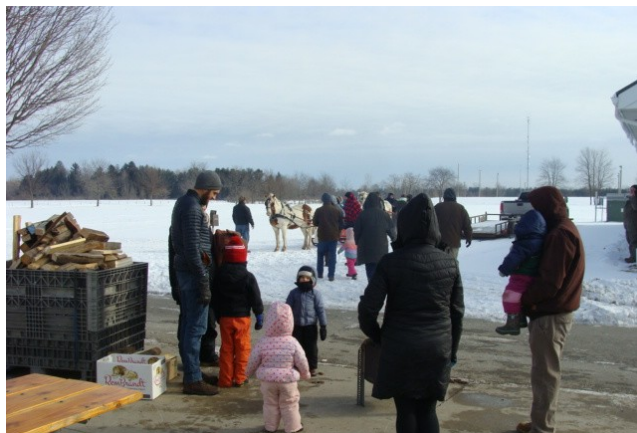
Warming by the fire