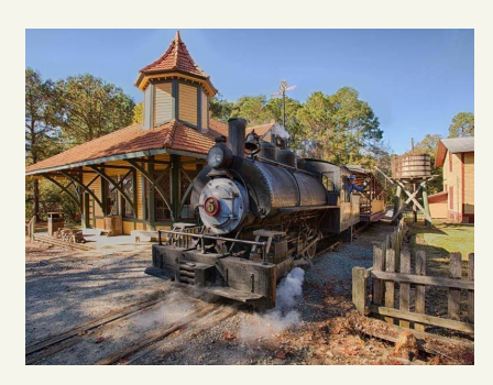
This beautifully restored vintage depot and Vulcan Steam Locomotive offer a special treat to visitors - an opportunity to take an authentic train ride in open passenger cars over narrow gauge rails through the museum grounds.

Each location has thoughtful docents who are at the ready to patiently explain all they know about the artifacts and operations. Docents are of all ages and many are from the Agriculture college.