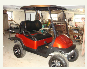
Continued on Pg. 5

This year our annual tractor raffle is again taking a twist. For first prize we will be giving away a golf cart. Second prize will be $500 while third place will take home three collectable model toy tractors. Tickets are available for purchase at a cost of $5 each or 5 tickets for $20 from most active farm museum members or at museum events.