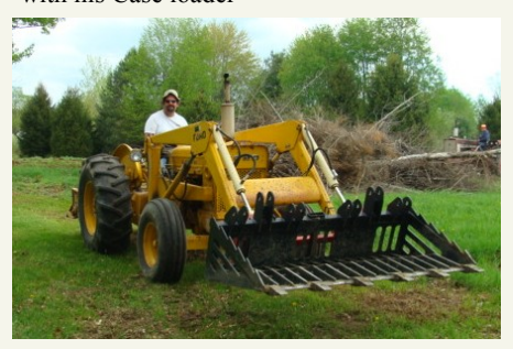
Ken Romak using the Ford loader to remove rocks