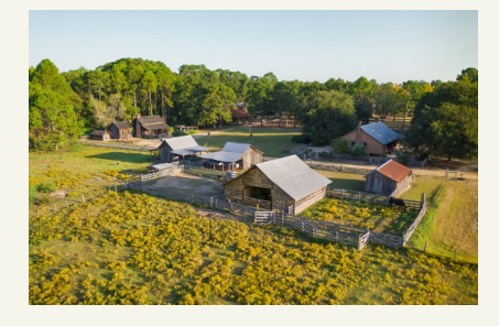
This 1830's era homestead and farm has live cows, a mule and work horse to authentically perform farm work utilizing implements of that time.

are also two general stores where visitors can buy fresh ground grits (delicious ground cornmeal) from the gristmill, old fashioned candies, the ever popular ice cream cones and souvenirs.